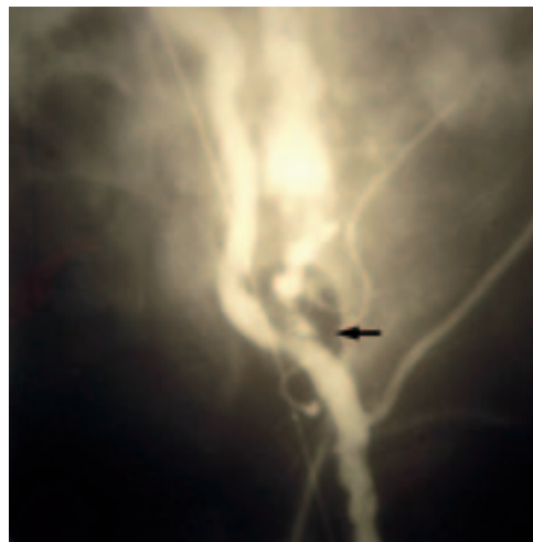
Figure 1. Arteriography showing the extravasation of a large quantity of contrast medium from the left external iliac artery (arrow).